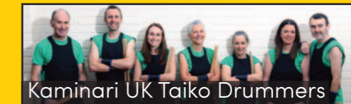
Kaminari UK Taiko Drummers