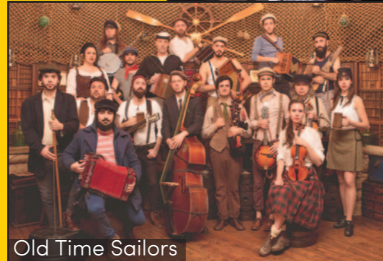
Old Time Sailors