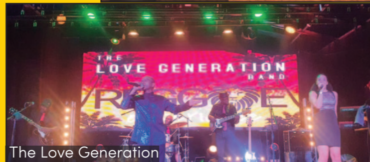
The Love Generation