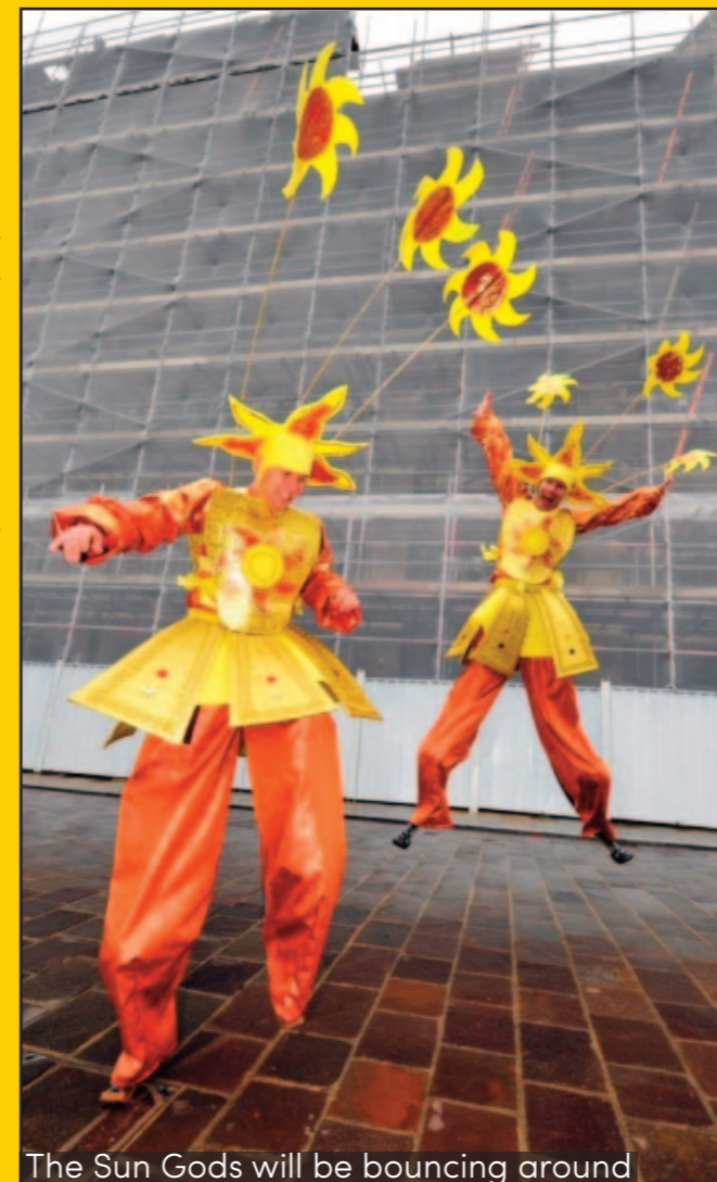
The Sun Gods will be bouncing around

And finally we extend our thanks to the amazing Beeston Womblers who are our chief litter pickers keeping the park clean today. Please help them by using the bins provided, or taking your litter home with you.